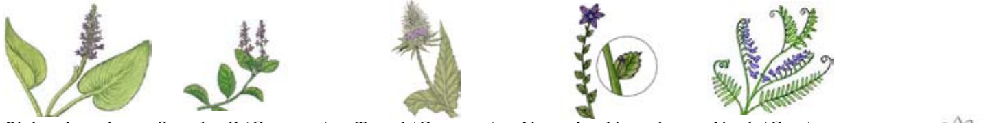
Pickerelweed Speedwell (Common) Teasel (Common) Venus Looking-glass Vetch (Cow)