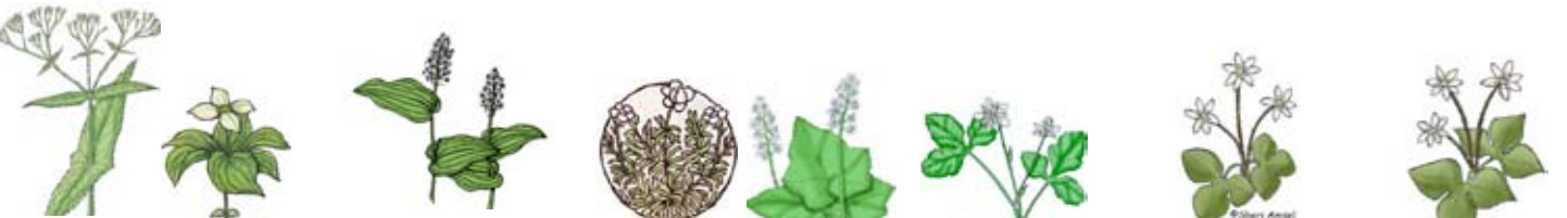
Boneset Bunchberry Canada Mayflower Diapensia Foamflower Goldthread Hepatica (Round and Sharp-Lobed)