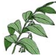
Solomons Seal (Great)