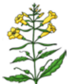
Foxglove (Smooth False)