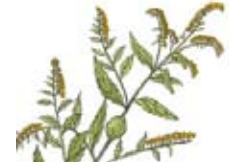
Goldenrod (Rough Stemmed)