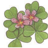
Wood Sorrel (Common)