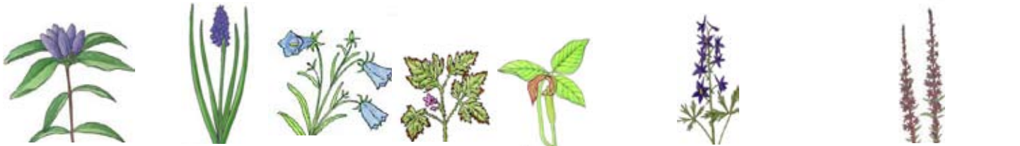
Gentian (Blind) Grape Hyacinth Harebell Herb Robert Jack-in-the-Pulpit Larkspur (Dwarf) Loosestrife (Purple)