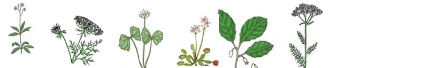
Pipsissewa Queen Anne's Lace Twinflower Venus Flytrap Wintergreen Yarrow