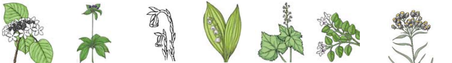
Hobblebush Indian Cucumber Root Indian Pipe Lily-of-the-valley Miterwort Partridgeberry Pearly Everlasting