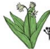
Bluebead Lily or Clintonia