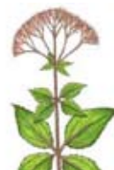
Joe-Pye Weed (Eastern and Spotted)