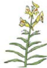
Butter and Egg