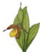
Lady Slipper (Yellow)